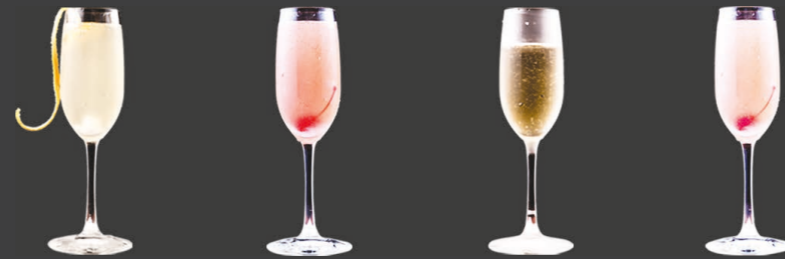
BELLINI Peach purée & house Champagne KIR ROYALE Blackcurrent liqueur & house Champagne FRENCH 75 Gin, lime juice & house Champagne STRAWBERRY BLISS Strawberry liqueur & house Champagne

with PROSECCO 8.95 + with CHAMPAGNE 9.95